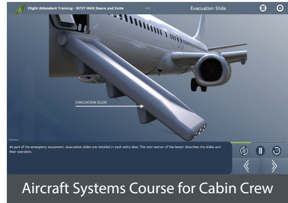
Aircraft Systems Course for Cabin Crew

For specific details and release dates for Cabin Crew Training Suites and 3D Cabins available by fleet, please contact our sales team: info@cpat.com .