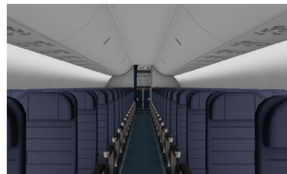
3D Cabin Trainer